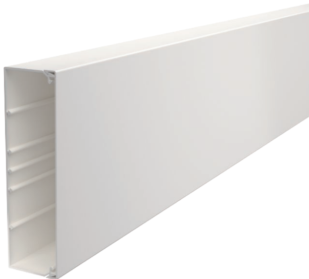
Trunking cover and base with base perforation.