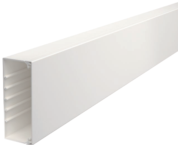
Trunking cover and base with base perforation.