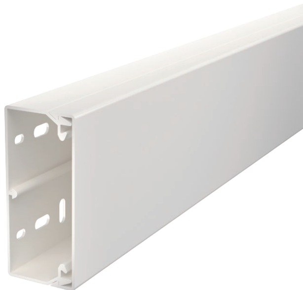
Trunking cover and base with base perforation.